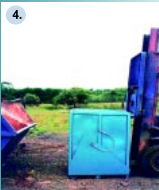
4. SUPER-BURRO is moved away from the skip and lowered to ground level where the base closes and locks automatically. There are no chains or fixings to remove.

Fed up with fiddly fork attachments? Up to your waist in WASTE? You want CONTROL? You want SAFETY? You need SUPER-BURRO™ THE WASTE HANDLING SUPER-HERO!