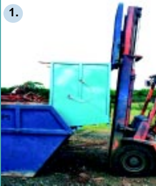
1. Driver positions SUPER-BURRO so that push arm on base touches edge of skip. As fork truck is driven forwards, mechanism unlocks, releasing hinged base.